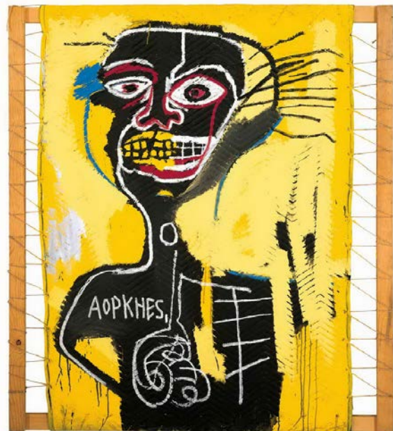
Basquiat "Art Is Ok"